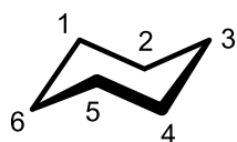
chair ( D_{3d} )